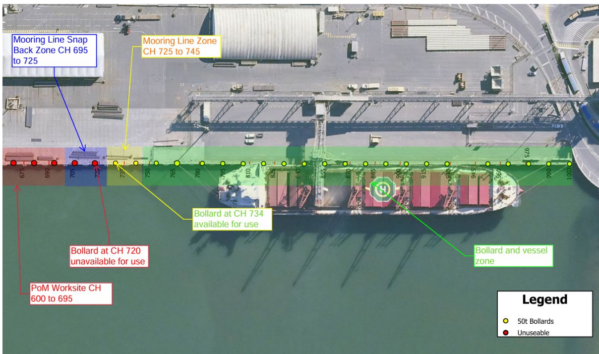
Appleton Dock berth E – Bollard availability during works