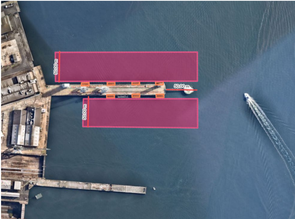
NELSON PIER WEST - DIVING OPERATION ZONES