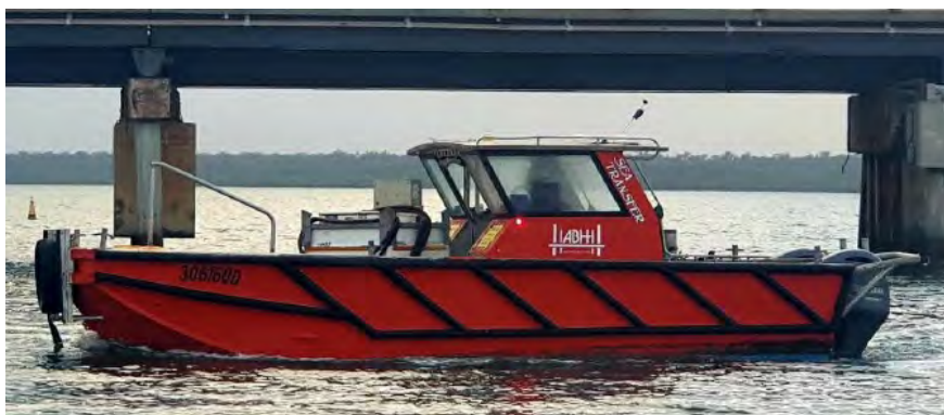
SEA TRANSFER 1